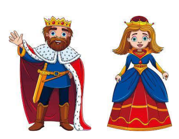
Worth 10 dojos

Imagine you are a King/Queen for a day! Write a diary entry about your day.