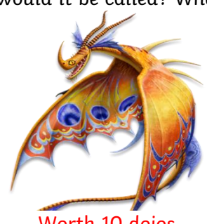
Worth 10 dojos

Design your own dragon. What would it look like? What would it be called? What can it do?