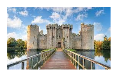
Worth 10 dojos

Research a castle in the UK and create a fact file to share with your class!